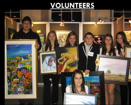
Art Auction 2009

The Shield of Athena must be one of the luckiest organizations when it comes to having people donate their time for its cause. We have close to 200 volunteers annually that lend a helping hand. I would like to give special thanks this year to the students of Lower Canada College who worked very hard and for many hours at our Art Auction.