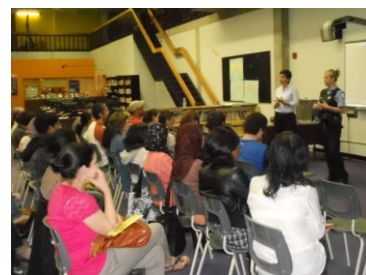
St. Pius X Adult Education Centre

17 focus groups in 9 ethnic communities were done in 8 languages so as to have a better understanding of perceptions of violence and knowledge about resources and laws. A report was presented to Justice Canada that would be used to update a multilingual booklet entitled "Abuse is wrong in any language"